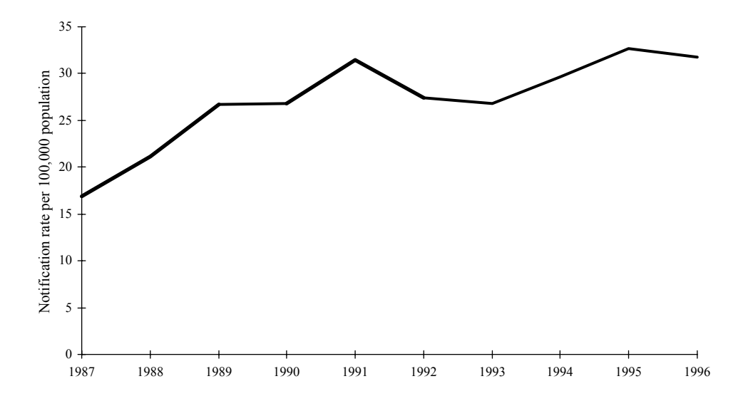
Figure 2: Notification rate for salmonellosis, 1987–96, by year